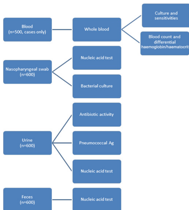
Figure 2 Microbiology testing schematic.

We will adhere to hospital procedures for avoiding hospital-acquired infections. We will wash hands with soap and water or alcohol-based hand sanitizer before patient contact. We will wear gloves, gowns and mask when required. We will clean the devices using alcohol swabs before and after each use.