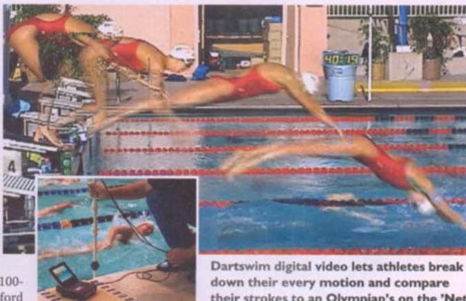
Dartswim digital video lets athletes break down their every motion and compare their strokes to an Olympian's on the 'Net.