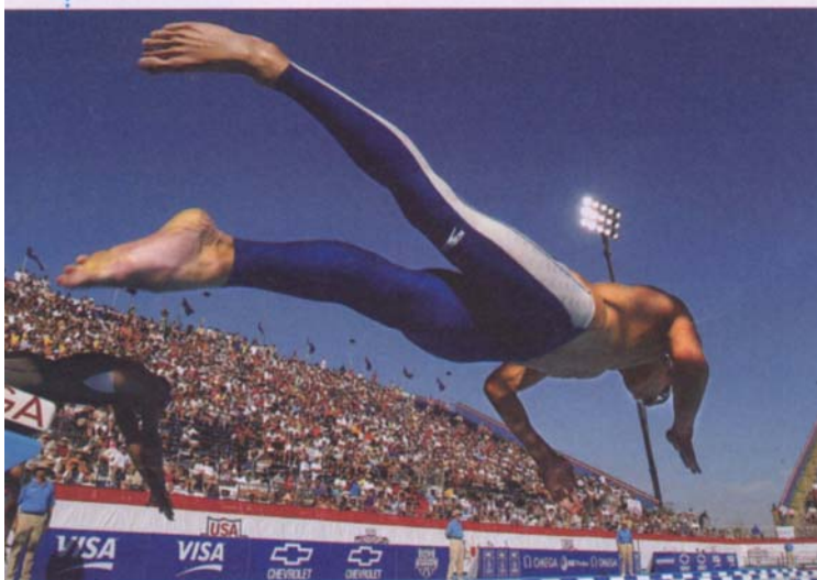
Phelps dived into his Olympic quest in a Speedo Fastskin II at last week's trials.