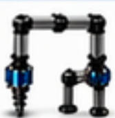
Drilling / Actuation Module